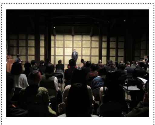
2022 Award Ceremony

Pre-registration required. If there are spaces available, you can participate on the day.