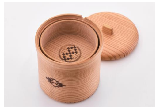
magewappakoubouE08 NAKAZAWA Eri «酒器セット» "Shuki set"