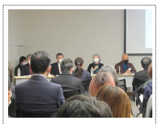
2022 Public Talk by the Judges